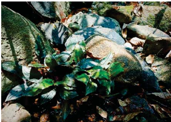
Fig. 2. In situ photograph of Cryptocoryne vinzelii showing its habit.